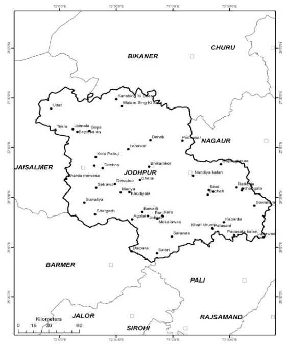
Figure 1. Location of the study area.

parts of the district. The vegetation of area is xerophytic, where most of the plant species are spiny having well developed root system and smaller in leaf size (Annex 1).